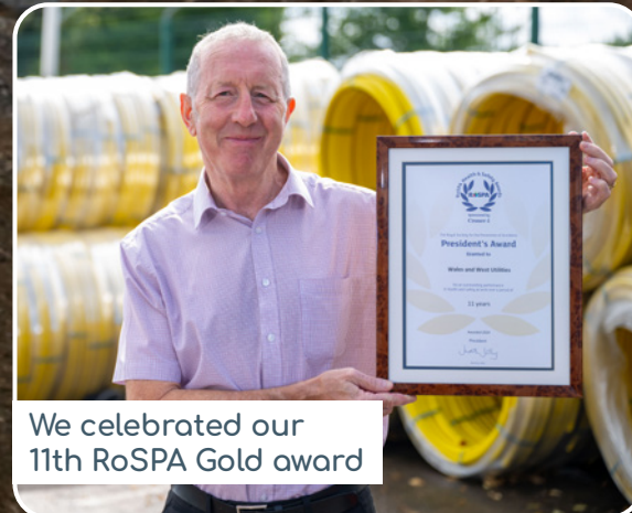
We celebrated our 11th RoSPA Gold award

This year, we also scooped the Linesearch before U dig (LSBUD) Best Damage Reporting Process Award for our continued reduction in third-party damages since becoming an LSBUD member. Awarded as part of National Safe Digging Week, the accolade recognises the work our Plant Protection team does to engage with customers on site before works start and provide safety guidance to minimise the risk of damage to our network.